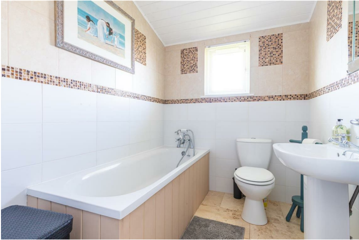
Bathroom 6'11" x 5'10" (2.13 x 1.79)